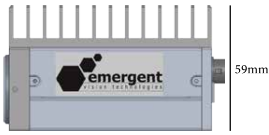
Side View Dimensions